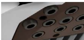
Multiple port diffuser nozzle maximizes drying effectiveness and comfort

The airforce hand dryer delivers high performance without the additional energy, maintenance or manual operation.